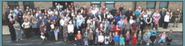
The Weekly Bulletin of the Summit Church of Christ

We love sharing the truth of God's Word!