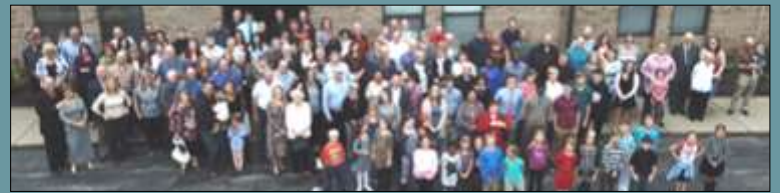
The Weekly Bulletin of the Summit Church of Christ

We love our visitors! We welcome you as our guest!