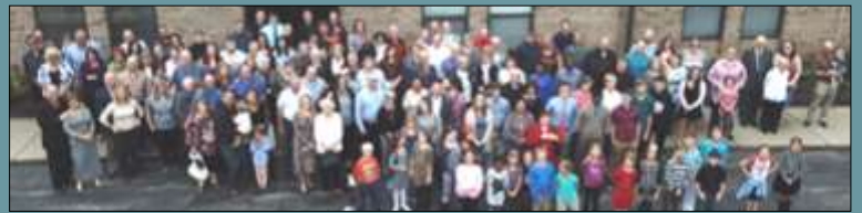
The Weekly Bulletin of the Summit Church of Christ

We love our visitors! We welcome you as our guest!