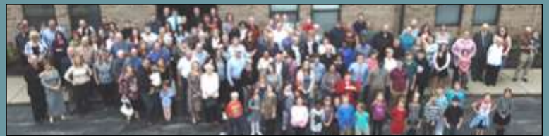
The Weekly Bulletin of the Summit Church of Christ

We love our visitors! We welcome you as our guest!