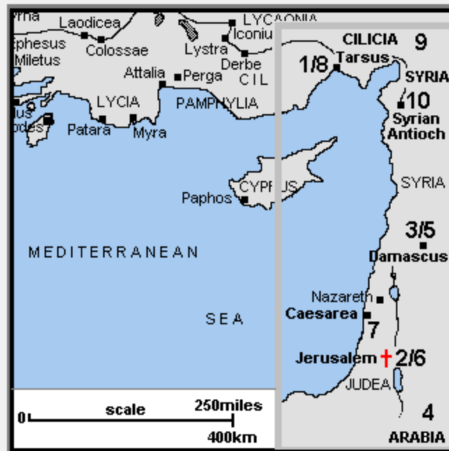
The Conversion and Earliest Journeys of Saul (Paul) of Tarsus c AD34-45